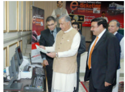
PRIME MINISTER SHAUKAT AZIZ INAUGURATING PAKISTAN RAILWAY E-TICKETING FACILITY AT PM HOUSE, ISLAMABAD ON JULY 20, 2007.