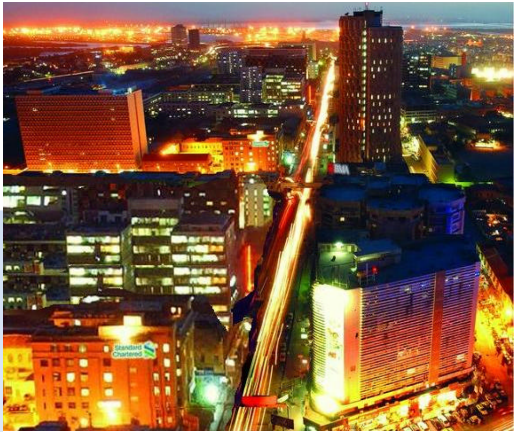
Aerial View: I.I. Chundrigar Road, Karachi.